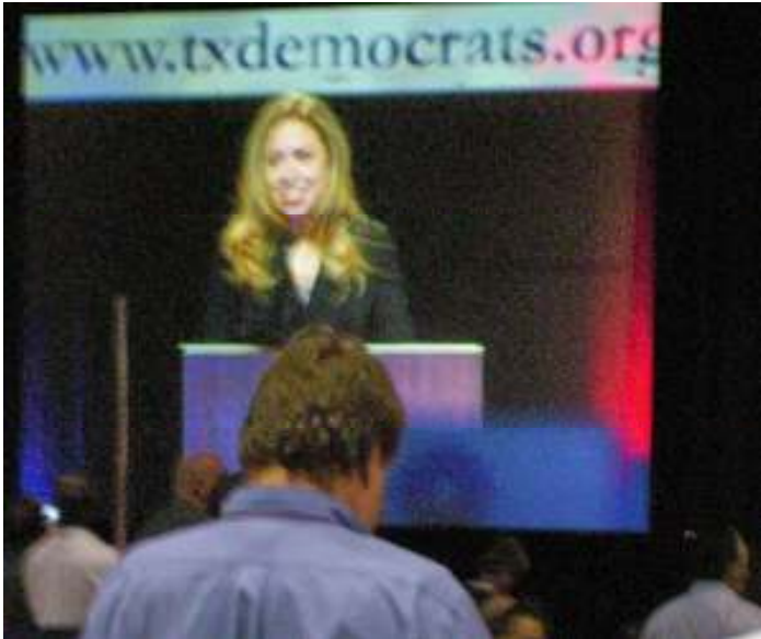
Chelsea comes to Texas: State convention delegates in Austin got a thrilling surprise when Chelsea Clinton appeared on stage to thank her mother's supporters and get the state convention off to a rousing start. Speakers' pictures were projected on a large screen so they could be seen in the back of the hall.