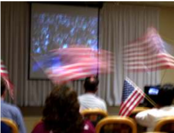
Club members and guests waved their flags and cheered as they watched Barack Obama speak before thousands in Denver on the last night of the national convention.