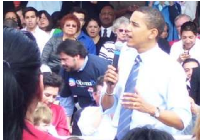
Obama makes it personal in San Antonio speech.